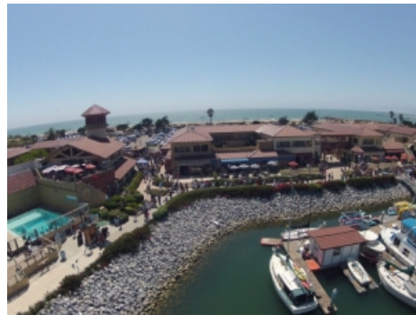
Ventura Harbor Village visitor-serving activities and hotels surround Harbor photo.